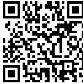
Figure 1: QR Code with Link to EPC 2025 Discord Server