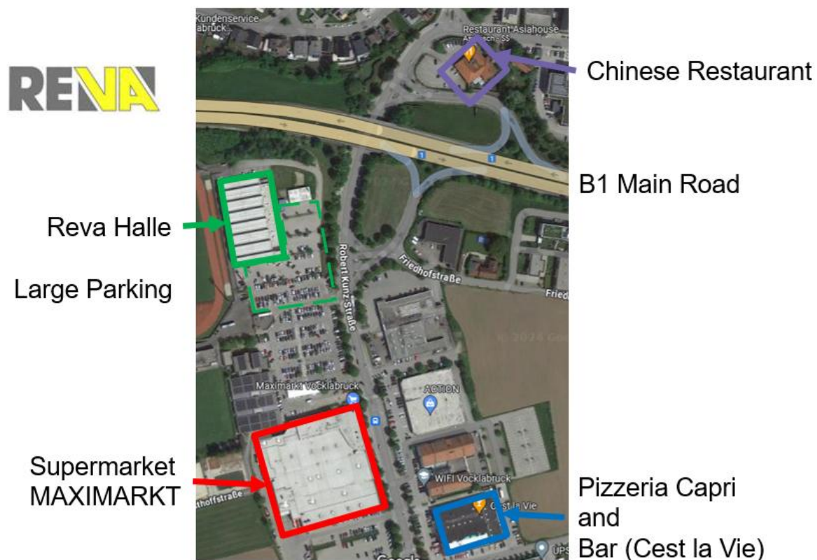
Figure 2: Overview plan of location for EPC25

The Whole Pinball area is placed on the "Ice Hockey" Field as you see in figure 1.